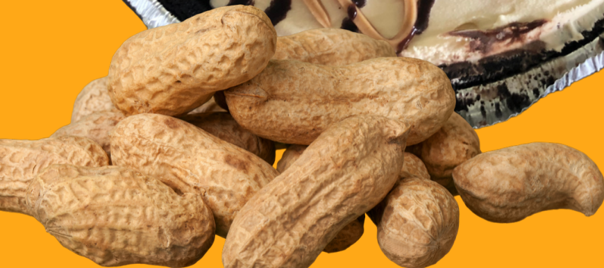
Peanut Butter Ice Cream Pie $14.99