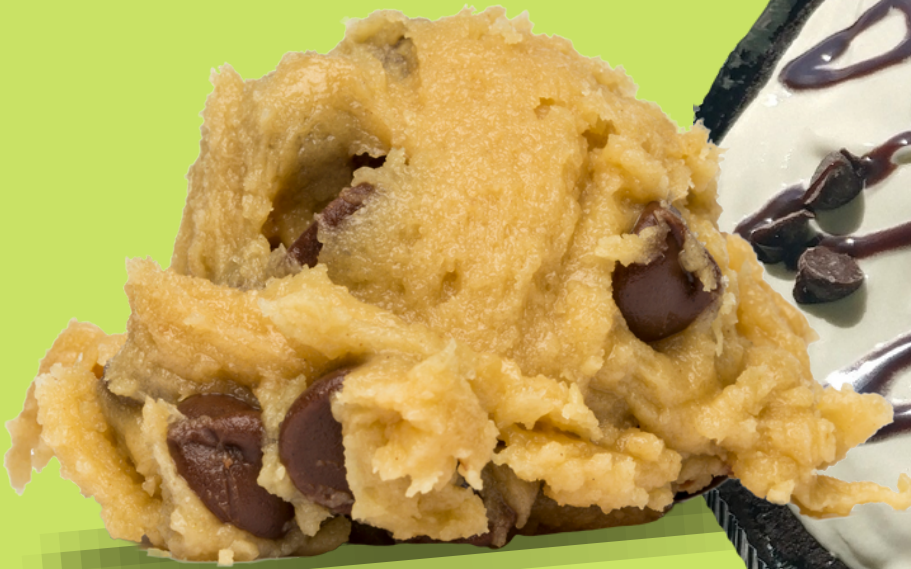
Cookie Dough Ice Cream Pie $14.99