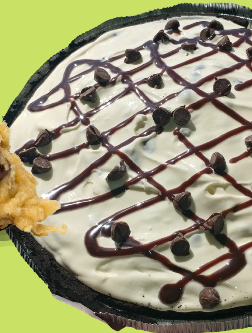
Oreo Ice Cream Pie $14.99