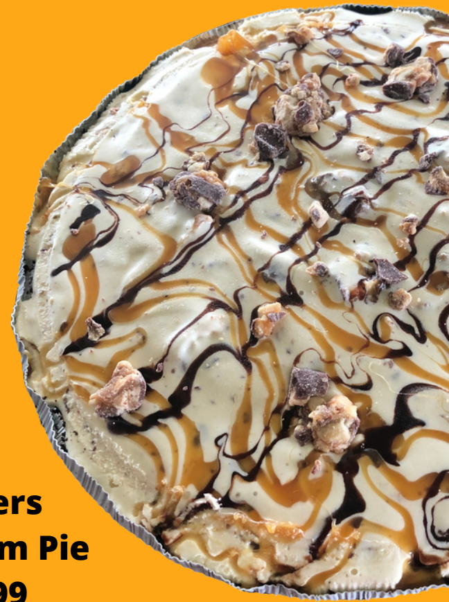
Snickers Ice Cream Pie $14.99